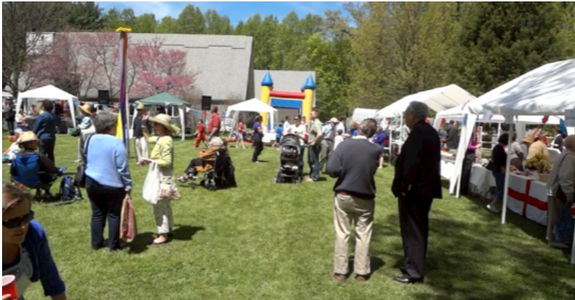
The Village Green, with Food Stalls on the right, and the Maypole on the left. Every village needs a Maypole!