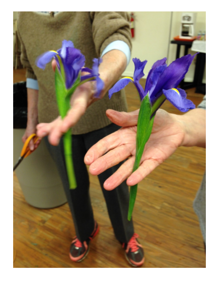
Cut greens short and place in front part of oasis so they hang down over the edge of the vase.