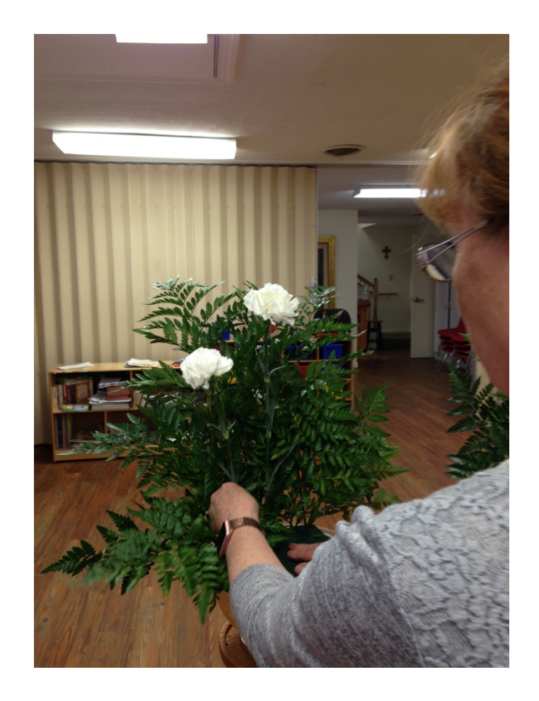
Continue adding flowers to create a pyramid effect.