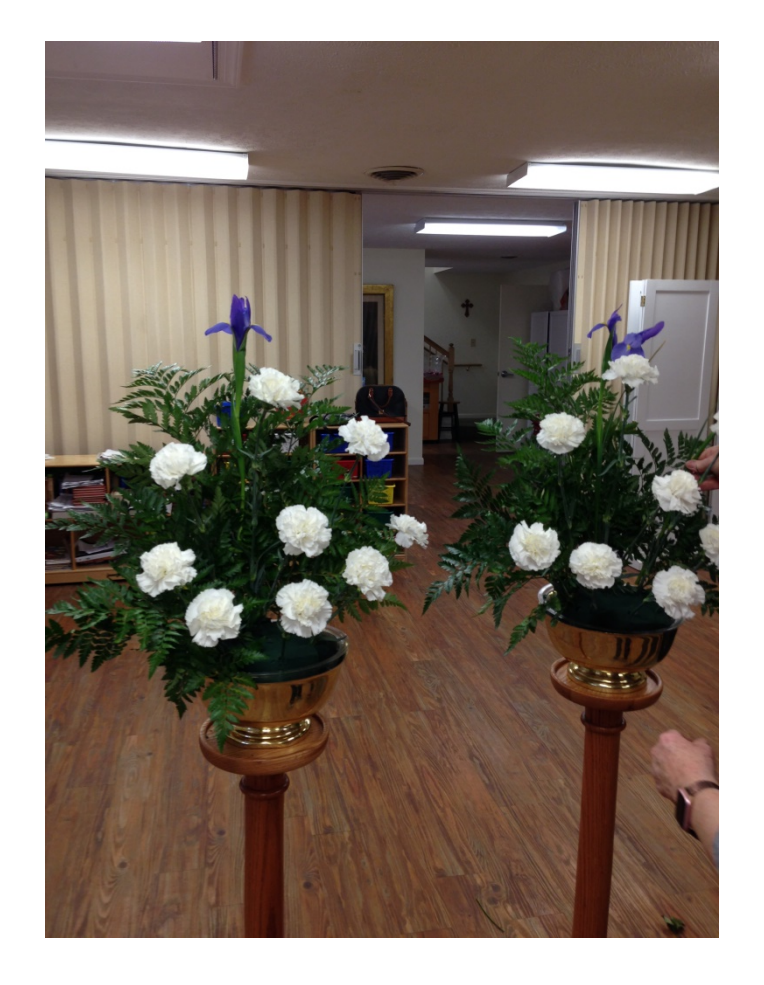
Continue placing additional flowers until arrangement looks complete.