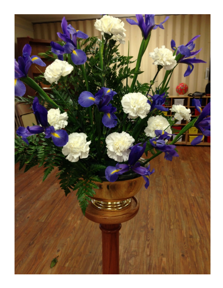
Place short stems to place flowers in front.