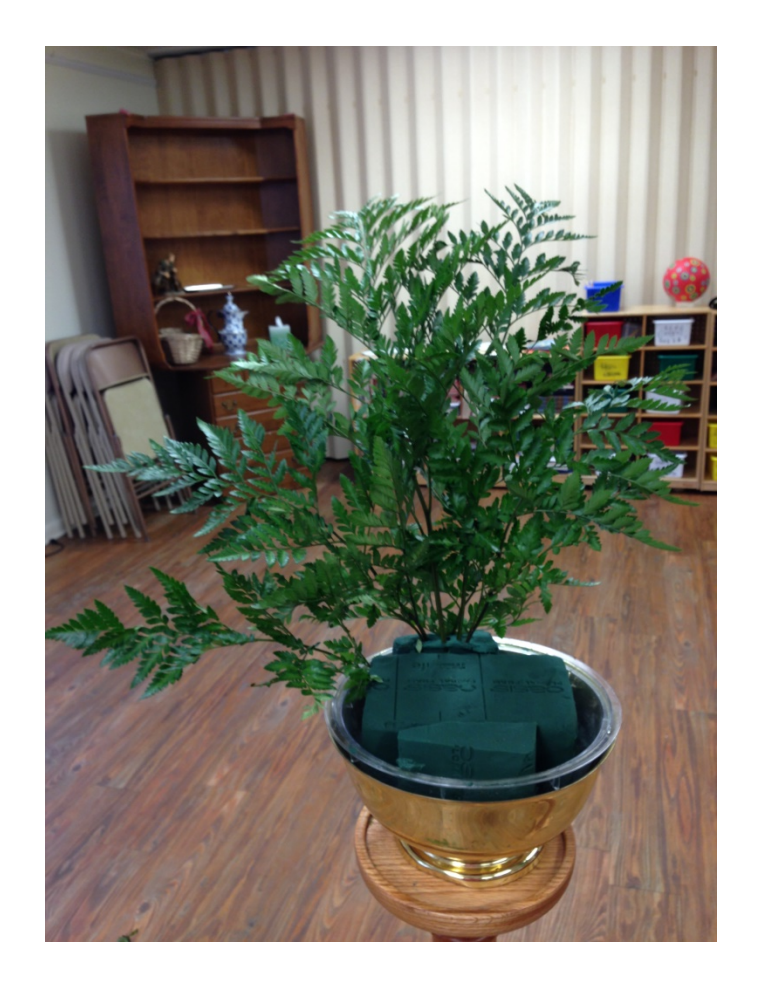
Repeat each step with the other vase. Fill in entire back and sides with greens, leaving front to do at the end.