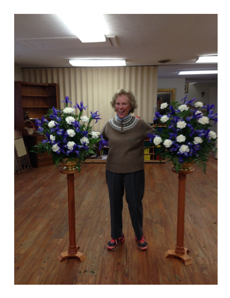
Carry vases and altar stands to each side of the altar, and then add additional water. Walk to back of church to view arrangements.