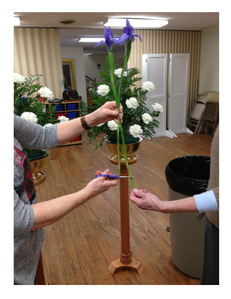
When all of one flower has been placed, begin placing additional flowers (when two varieties are used.)