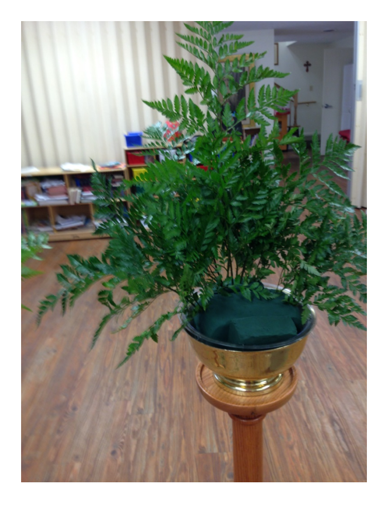
Begin filling in flowers. Start with one tall flower at the back. Always cut flowers before placing in oasis so that they can soak up water more easily. Cut flowers at an angle. If there are nubs on flowers, cut above the nub.