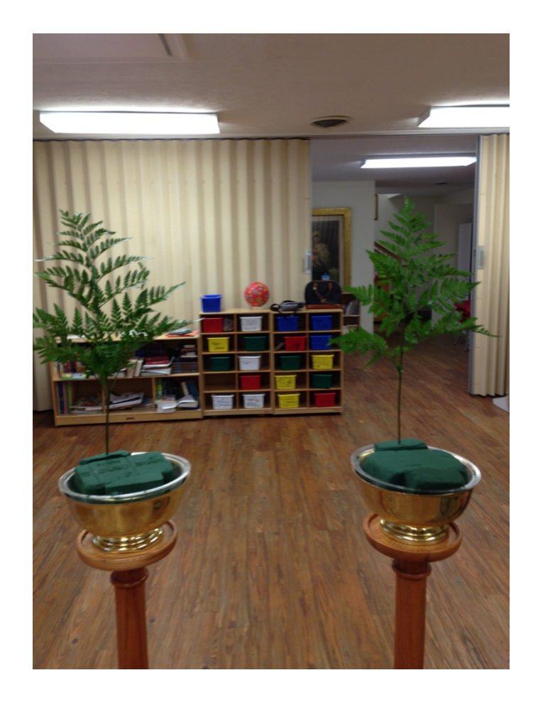
Fill in the back of the vases with additional greens. (Don't worry about the front – that will be filled in later.)