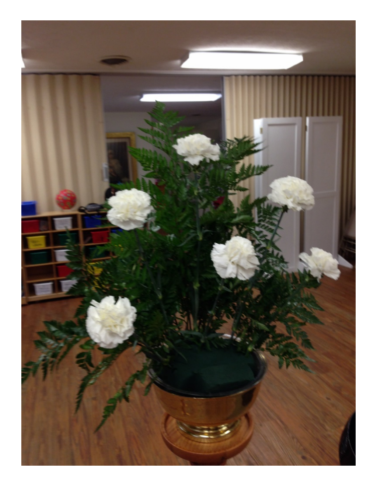
To ensure best mirror image, cut two flowers together – then stems will be the same length.