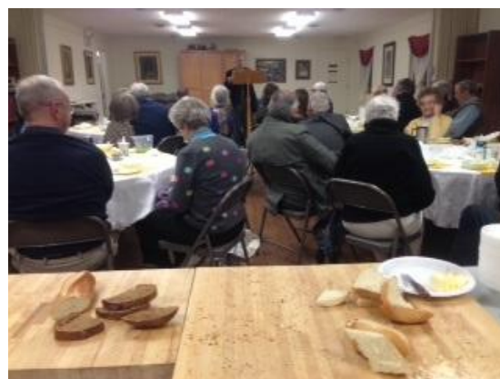
Lenten Series over soup and bread, The Shroud of Turin, beginning with relics.