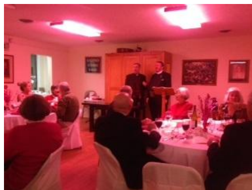
Valentine Dinner and Auction FEB 14