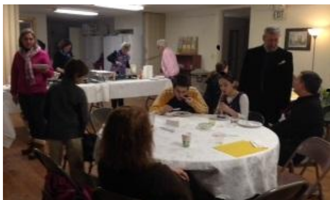
Shrove Tuesday, all the pancakes you could eat!