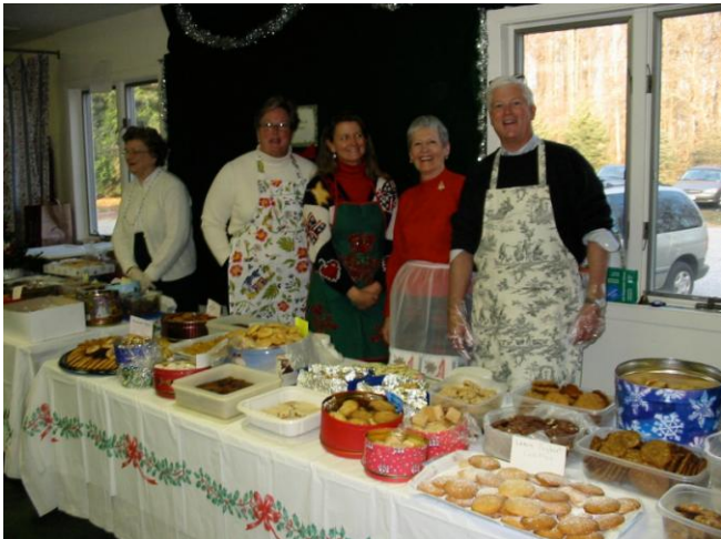
The crew gets ready for first customers!