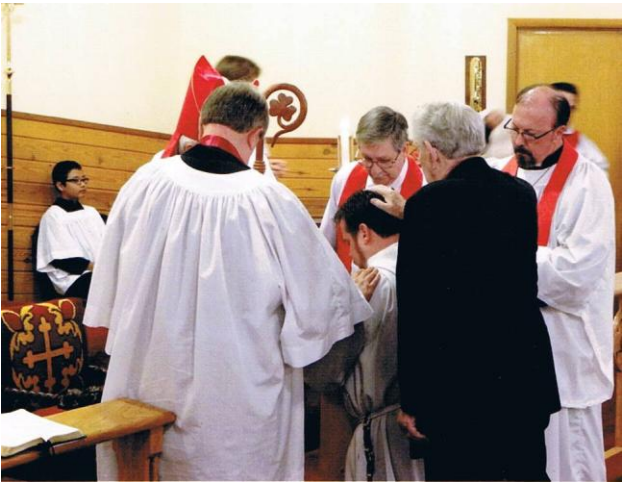
Laying of hands to bless the new priest!