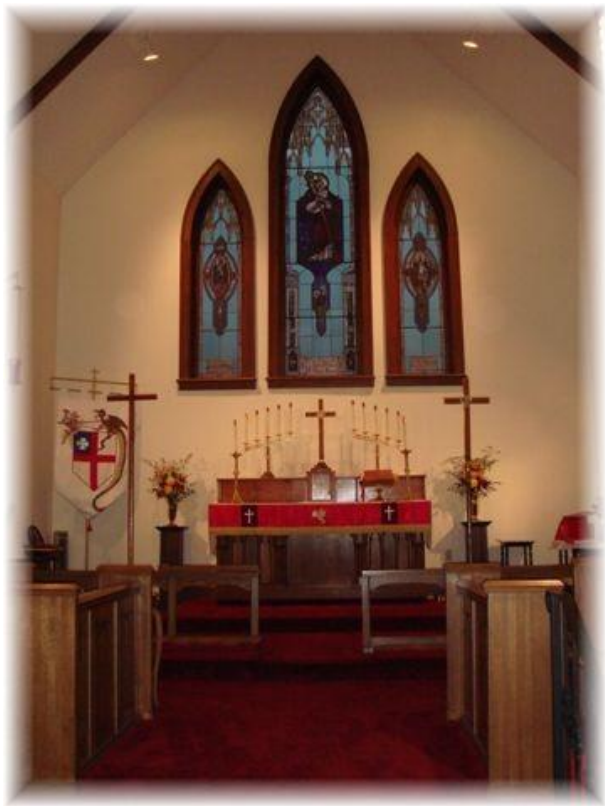
A view of the altar at St. George’s Anglican Church, Columbus, GA.